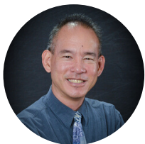
Associate Pastor, Community Life

T = is it True ? H = is it Helpful ? I = is it Inspiring ? N = is it Necessary ? K = is it Kind ?